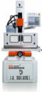
DRILL EDM (Pg. No. 08)