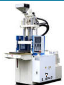
VERTICAL MOULDING (Pg. No. 21)