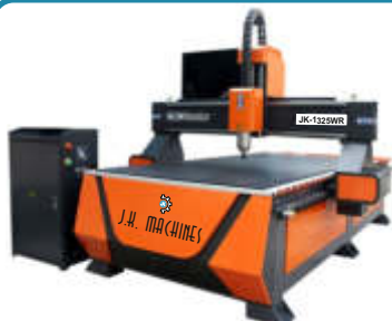
CNC WOOD ROUTER (Pg. No. 17)