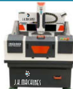
CNC ENGRAVING (Pg. No. 15)