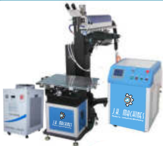
LASER WELDING (Pg. No. 11)