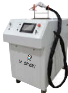
HAND HELD LASER (Pg. No. 12)