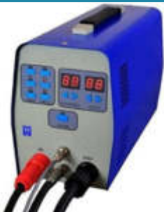
MIRO TIG WELDING (Pg. No. 14)