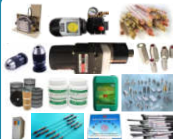
CONSUMABLES/SPARES (Pg. No. 20)