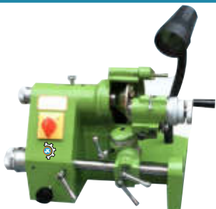
SINGLE LIP GRINDER (Pg. No. 18)