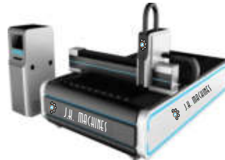
FIBER LASER CUTTING (Pg. No. 13)