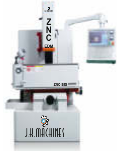
ZNC EDM AC SERVO (Pg. No. 06)