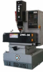
ZNC EDM DC SERVO (Pg. No. 05)