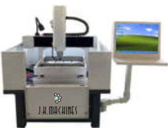
CNC ENGRAVING (Pg. No. 16)