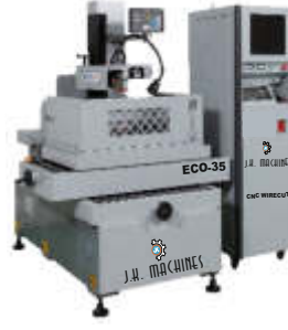
CNC WIRE CUT DC STEPPER (Pg. No. 09)