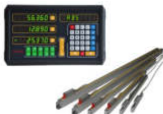
DIGITAL READOUT (Pg. No. 19)