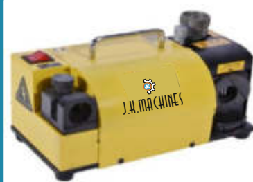
DRILL BIT GRINDER (Pg. No. 18)