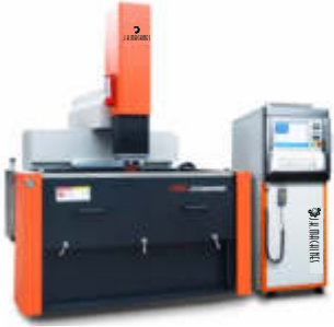
CNC EDM (Pg. No. 03)