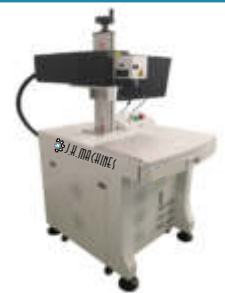
LASER MARKING/ENGRAVING (Pg. No. 14)