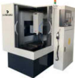
CNC ENGRAVING (Pg. No. 15)