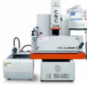
CNC EDM (Pg. No. 04)