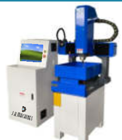
CNC ENGRAVING (Pg. No. 16)