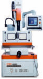
CNC DRILL EDM (Pg. No. 07)