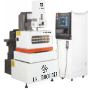
CNC WIRE CUT AC SERVO (Pg. No. 10)